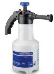
Foam-Matic 1.25 E (Blue = Alkaline foaming agents) Art.No. 11976601