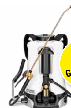
Spray-Matic 10 B 10 liters backpack sprayer, externally mounted pump, 6 bar, fanjet brass nozzle, robust and ergonomically shaped tank, Viton gaskets