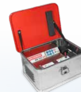
BM 1035 AC1 Pressure controlled pump station, Li-Ion battery, 0.5 to 6 bar, suction hose (without hose, trigger valve, spray tube and nozzle), Viton gaskets