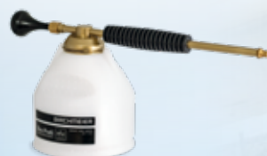
Rex Profi 1.7 liters hand sprayer, robust piston pump, piston pressure up to 20 bar, brass nozzle, Viton gaskets