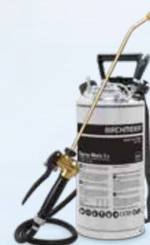
Spray-Matic 5 S 5 liters compression sprayer, brass hand pump, 6 bar, adjustable brass nozzle, safety valve, compressed air valve, separate filling opening, Viton gaskets