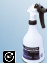
Super McProper Plus 0.5 liter hand sprayer, piston pressure up to 15 bar, adjustable plastic nozzle, flexible suction hose, 360° function