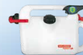
Rapidon 6 Refuelling at your fingertips, fast, easy and comfortable

19 x 12.5 cm, diameter of connection 2.1 cm Art.No. 10301203