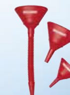
Funnels 14 x 9.5 cm, height 16.5 cm Art.No. 72600399

19 x 12.5 cm, height 21 cm Art.No. 72600499