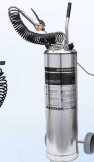
Spray-Matic 20 S 20 liters compression sprayer, 6 bar, adjustable brass nozzle, safety valve, without hand pump with compressed air valve, hand cart, Viton gaskets

Art.No. 11380002 with hand pump Art.No. 11380004 without hand pump