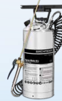
Spray-Matic 10 S 10 liters compression sprayer, brass hand pump, 6 bar, adjustable brass nozzle, safety valve, compressed air valve, separate filling opening, Viton gaskets

Art.No. 11380002 with hand pump Art.No. 11380004 without hand pump