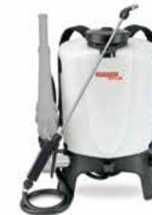
RPD 15 PB1 15 liters backpack sprayer, piston pump in the pump lever, 3 bar, adjustable stainless steel nozzle, ergonomically shaped tank, Viton gaskets