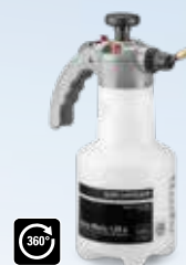
Spray-Matic 1.25 N 1.25 liters hand compression sprayer, 3 bar, adjustable brass nozzle with swivel head, safety valve, push button lock, flexible suction hose, 360° function, Viton gaskets, polyamid pump head