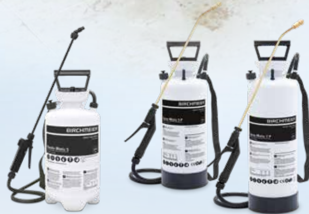
Rondo-Matic 5 5 liters compression sprayer, 3 bar, adjustable plastic nozzle, safety valve, Viton gaskets