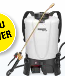
REC 15 PC1 15 liters pressure controlled battery backpack sprayer, without battery, 0.5 to 6 bar, fanjet brass nozzle, ergonomically shaped tank, Viton gaskets