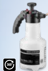
Spray-Matic 1.25 P 1.25 liters hand compression sprayer, 3 bar, adjustable brass nozzle with swivel head, safety valve, push button lock, flexible suction hose, 360° function, Viton gaskets